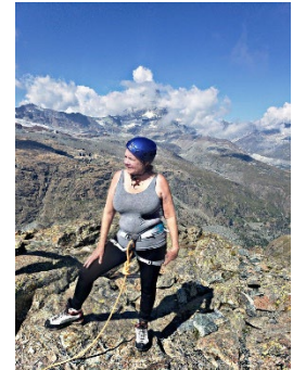
Reaching the pinnacle!

*APLUS+ gratefully offers a 5% discount to organizations registering 5 or more attendees, and a 10% discount to organizations registering 10 or more attendees.